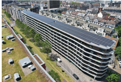
Speicherstraße, Frankfurt am Main

As pioneers in energy-efficient buildings, we have gained more than 20 years experience and become experts in building Passive Houses and implementing plus-energy technologies. We are committed to making a valuable contribution to intelligent and sustainable urban development, affordable housing and urban mobility solutions in the Rhein-Main region.