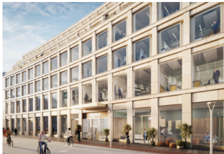
Midstad Karlsruhe, Germany

Together with scientists, urban planners, architects, and representatives from the business sector, Midstad explores the development potential of areas and buildings. The core consists of user-oriented concepts that have a positive impact on their surroundings and provide fresh impulses in the urban context. An offer-oriented spectrum at