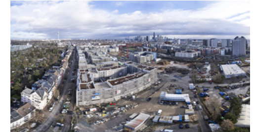
Drone photo Schönhof-Viertel, Frankfurt am Main

design with high energy standards for individual buildings, climate-friendly district heating, photovoltaic systems for green electricity and the intelligent use of rainwater. NHW and Instone are aiming for the Gold certification from the German Sustainable Building Council (DGNB).