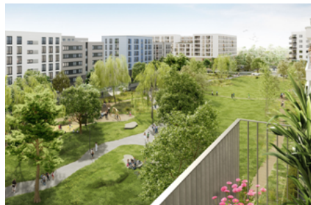
Visualization Quartierspark (neighbourhood park) / Schönhof-Viertel, Frankfurt am Main

design with high energy standards for individual buildings, climate-friendly district heating, photovoltaic systems for green electricity and the intelligent use of rainwater. NHW and Instone are aiming for the Gold certification from the German Sustainable Building Council (DGNB).