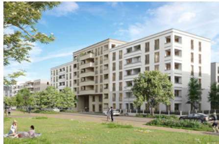
Schönhof-Viertel, Frankfurt am Main

In Frankfurt, NHW is currently realizing one of the largest and most important development projects in the federal state of Hesse. Together with our project partner Instone, NHW is developing around 2,000 flats on a total of 15 construction sites in the Schönhof-Viertel by 2026. The aim is to achieve a high level of architectural diversity and quality. A lively mix of subsidised flats, privately financed rental apartments and owner-occupied flats is planned. A total of 30 percent of all flats are subsidised. In addition to retail and commercial space, a total of five daycare centres and a hybrid primary school for holistic learning concepts are being built. The new neighbourhood is characterized by an ecological