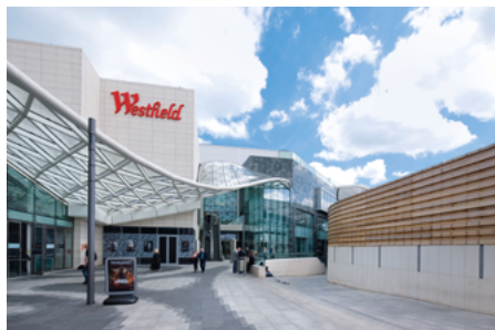
Westfield London, UK

Launched in 1972, hausInvest is one of the oldest German open-ended real estate funds – and with a fund volume of 17.3 billion euros, it is also the second largest. It is used by private investors as a vehicle to invest in high-quality properties in prime locations in metropolises and medium-sized cities in Germany, Europe, the USA and Australia. Providing the planned German investment regulation changes will be implemented in 2024, Commerz Real intends to invest up to ten per cent of the fund volume in renewable energies.