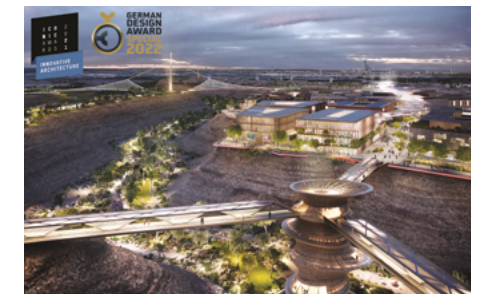
'Mohammed Bin Salman Nonprofit City' General Master Plan | Riyadh, KSA