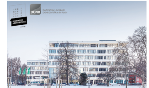
Headquarters Heidelberg Materials AG, GER

architects/planners Hedderichstraße 108-110 60596 Frankfurt am Main Germany +49 69 6050 11-0 mail@as-p.de www.as-p.com