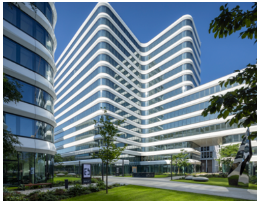
EUROPA-CENTER | FLOW, Frankfurt am Main

Currently under construction is the EUROPA-CENTER | Wing in Bremen adding another 10,000 sqm office space to our portfolio. Further projects are planned on our plots in the Rhein-Main area and in Barcelona.