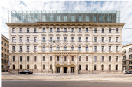
Midstad Vienna Belvedere, Austria

Midstad is the pulse of the city center. Midstad provides space for diversity and everything that enriches urban life. Midstad is a concept based on comprehensive research and experience. Behind it is a strong team – real estate experts, project developers, researchers, and scientists. Together, our goal is to develop properties with future-proof usage concepts, turning them into favorite places that will revitalize our city centers in the long term.