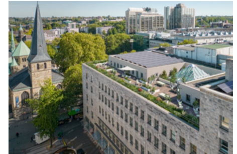
Midstad Essen, Germany

At the same time, they are attractive and strengthen people's connection to the city center. We analyze local conditions and create suitable offers with Midstad: from work to leisure. From dining to shopping. From education to sports.