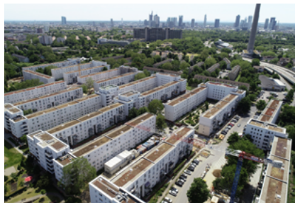
Platensiedlung, Frankfurt am Main